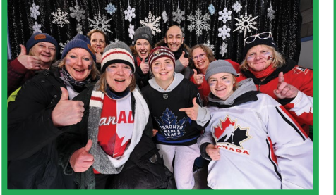
Mayor Dorothy McCabe with the City of Waterloo Team.