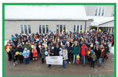
173 walkers and over 30 volunteers participated on event day