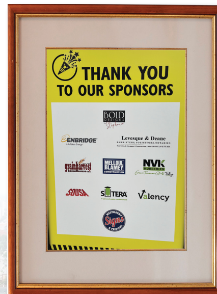
A special thank you to all the sponsors for making the event possible