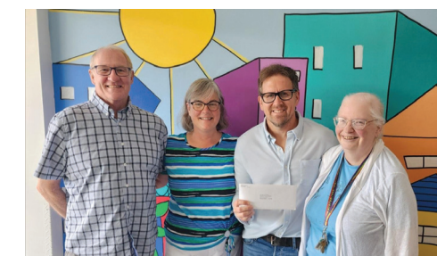
SHOW was presented with a cheque from members of Trinity United Church to help support the work of SHOW's Life Skills Coordinator.

Assessment to gauge their overall feelings of well-being. Many said their overall health was suffering and several reported feeling incredibly lonely and isolated.