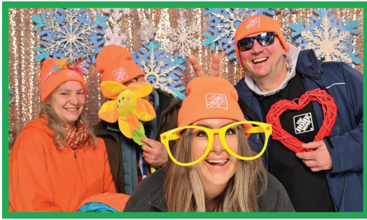
We were so lucky to have the Home Depot team join us this year – they were SO fun!