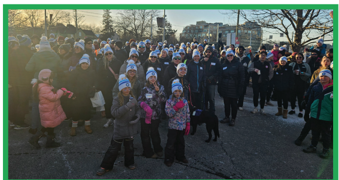
Walkers get ready to leave First United Church to walk in support of SHOW residents