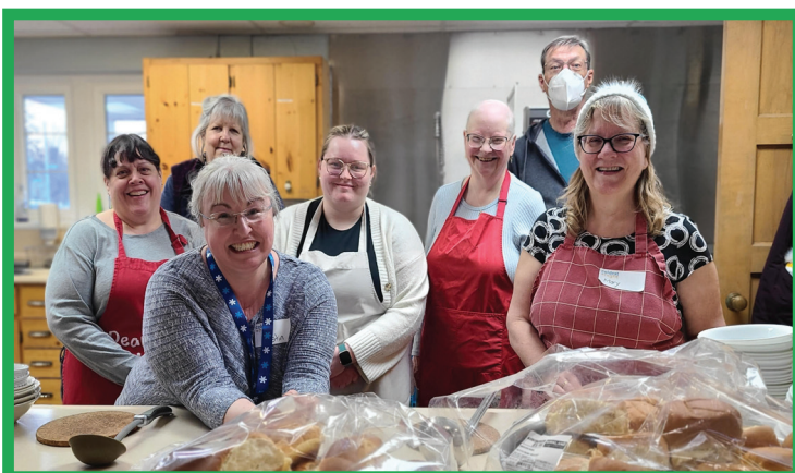
Volunteers in the kitchen were busy all afternoon making vegetarian chili for our walkers